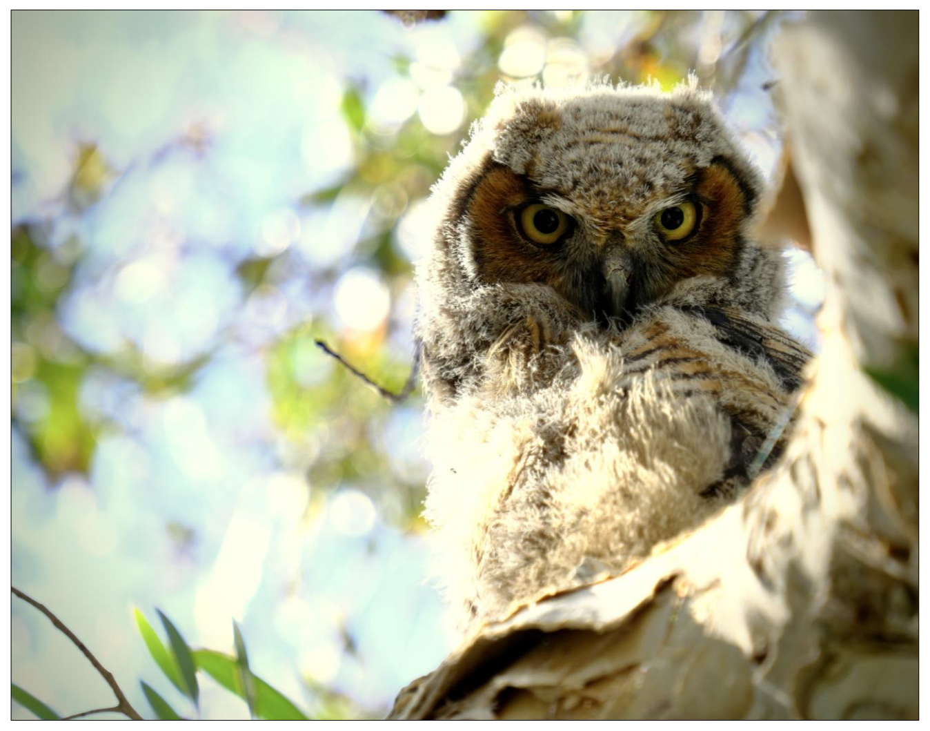
Juvenile Great Horned Owl, Encinitas