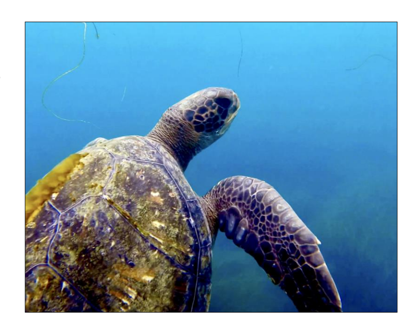
Green sea turtle. Encinitas

Attendance & Participation (5%) Reading Discussion Questions (20%) Final Exam (25%)