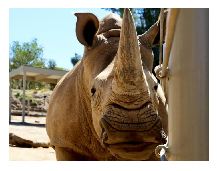
Victoria SWR SD Global Zoo Escondido

Pollution, Precaution, and Environmental Justice . Rachel Carson's Silent Spring awakened the country to the dangers of chemical pollution. Pollution raises interesting questions for our understanding of property rights, risk, and justice.