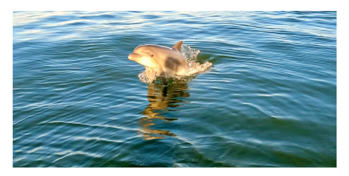
Juvenile hottlenose dolphin Encinitas

Students requesting accommodations must provide a current Authorization for Accommodation (AFA) letter issued by the Office for Students with Disabilities (OSD) which is located in University Center 202 behind Center Hall. Students are required to present their AFA letters to me and to the OSD Liaison in the department in advance so that accommodations may be arranged. The <u>OSD</u> can be contacted at osd@ucsd.edu (email).