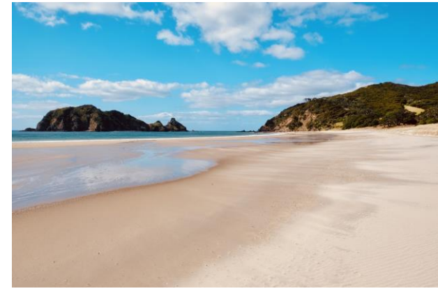
Palzitu Island N7. Chould it have invacive rate

In each section, we'll mix theoretical problems in philosophy with practical problems facing us today. The main goal of the course is that students come to understand the way that ethical values and arguments underlie many of today's debates about the environment. These arguments will have relevance to many decisions you'll make in life, ranging from personal ones (e.g., what car should I buy? what should I eat?) to your views on major public policy choices (e.g., just energy transition). By the quarter's end, successful students will be able to identify the values at stake in environmental decisions and see the strengths and weakness of various positions. Along the way, students will also improve their ability to critically read and appraise academic essays, write such an essays, create and complete an independent project, and more.