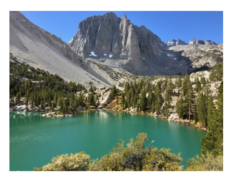
What's left of the Palisades Glacier Fastern Sierra