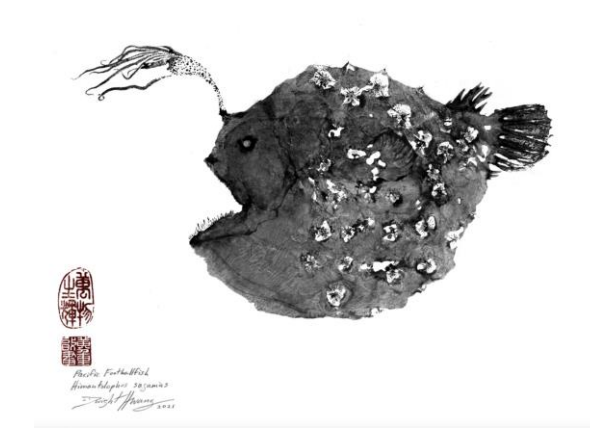
Pacific Footballfish, found Swamis Beach, Encinitas