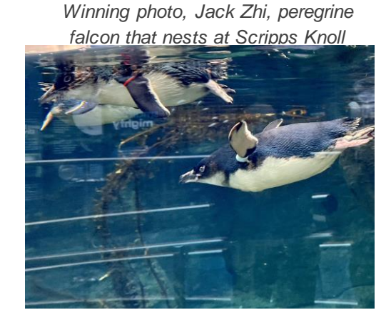
Little nenauin Rirch Aauarium

Oct 16, 5pm Meet at Birch Aquarium entrance